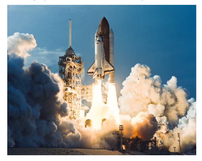
Figure 3.7 Demonstrating Newton's Third Law. The U.S. Space Shuttle (here launching Discovery ), powered by three fuel engines burning liquid oxygen and liquid hydrogen, with two solid fuel boosters, demonstrates Newton's third law.

This is the principle behind jet engines and rockets: the force that discharges the exhaust gases from the rear of the rocket is accompanied by the force that pushes the rocket forward. The exhaust gases need not push against air or Earth; a rocket actually operates best in a vacuum (Figure 3.7).